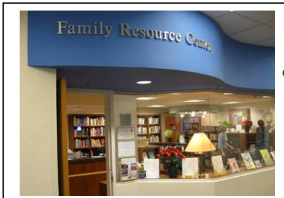
Family Resource Center St. Louis Children's Hospital Third Floor, Room 3S-12 314-454-2350