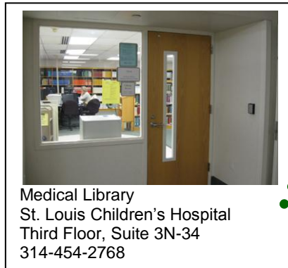
Medical Library St. Louis Children's Hospital Third Floor, Suite 3N-34 314-454-2768