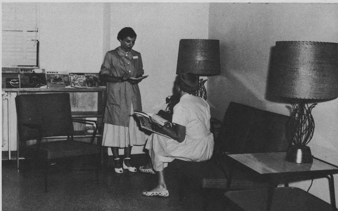
Volunteer Worker of Auxiliary Greets Incoming Patient in Newly Decorated Admitting Office Waiting Room. (See page 5 for story of Women's Auxiliary Decorating Committee.)